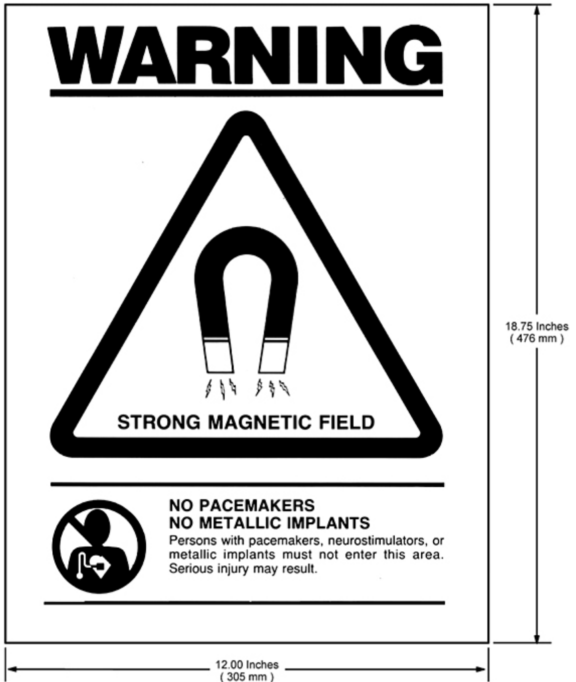
Illustration 4: Magnetic Field Security Zone Sign (46-255325P1) for Magnets < 3.0T