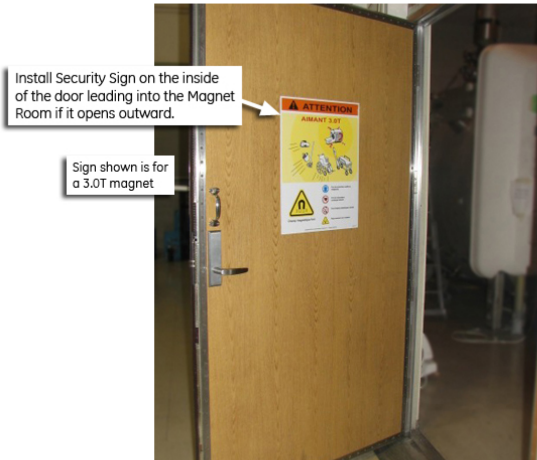
Illustration 3: Magnet Field Exclusion Zone Warning Sign (46-255326P1)