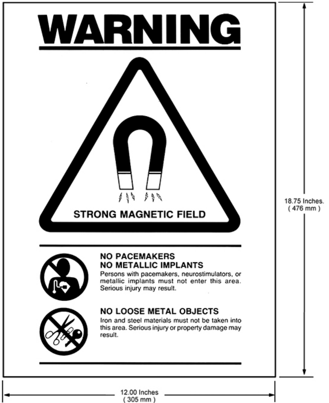
Illustration 5: Magnetic Field Security Zone Sign for 3.0T Magnets (5120663)