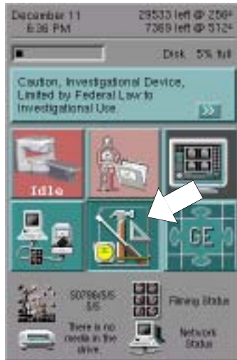
SERVICE DESKTOP ILLUSTRATION 1