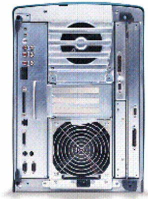
OCTANE REAR CONNECTIONS ILLUSTRATION 3-1

Refer to Illustration 3-1 for the computer output connections.