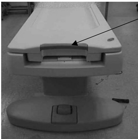
Emergency Release Handle