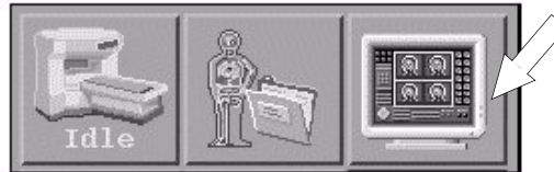
AW Icon ILLUSTRATION 4