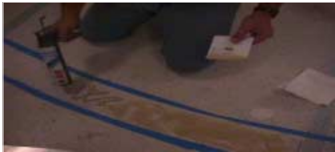
GLUING THE WEAR PLATE/RACE TO THE FLOOR ILLUSTRATION 3