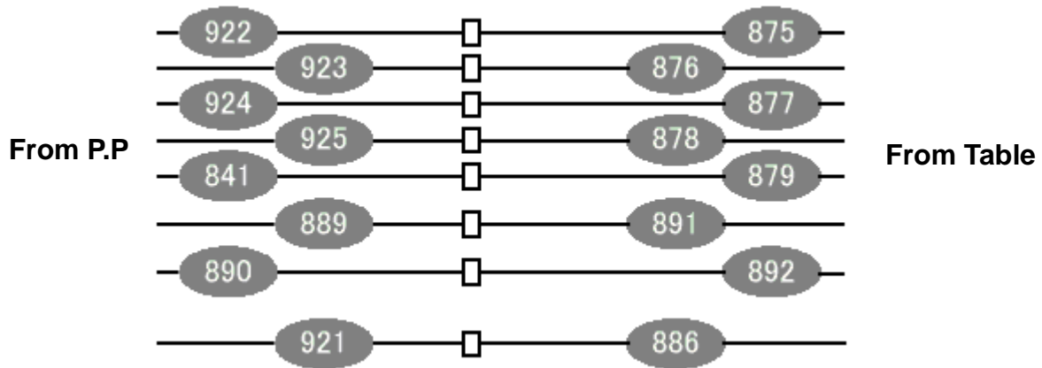
CABLE CONNECTION ILLUSTRATION 2

2. Connect the cables at the rear of the Magnet according to the following illustration.