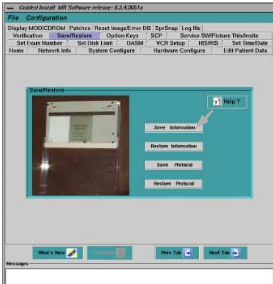
SAVE/RESTORE GUI ILLUSTRATION 3

8. Click [Yes] for the Save Info Dialog.