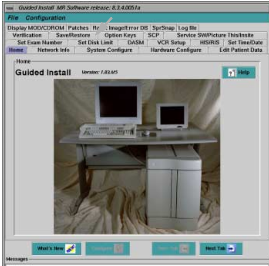
INSTALL GUI ILLUSTRATION 2

6. The following Screen is displayed. Click "Save/Restore".