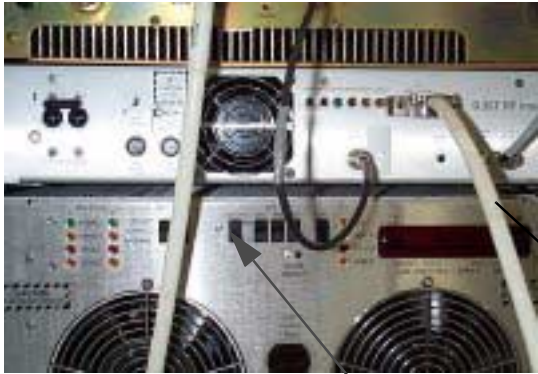
Power Unit (front view)