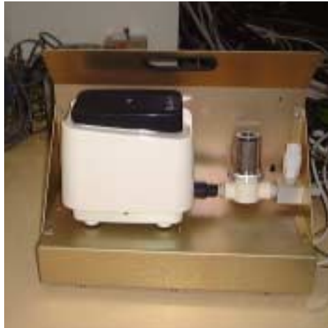
PATIENT COOLING MODULE ILLUSTRATION 1