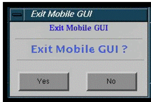
Illustration 8-2 Exit Mobile GUI

Select Yes at the Exit Mobile GUI pop-up menu. See illustration 8-2.