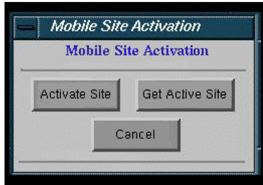
ILLUSTRATION 7-1 MOBILE SITE ACTIVATION