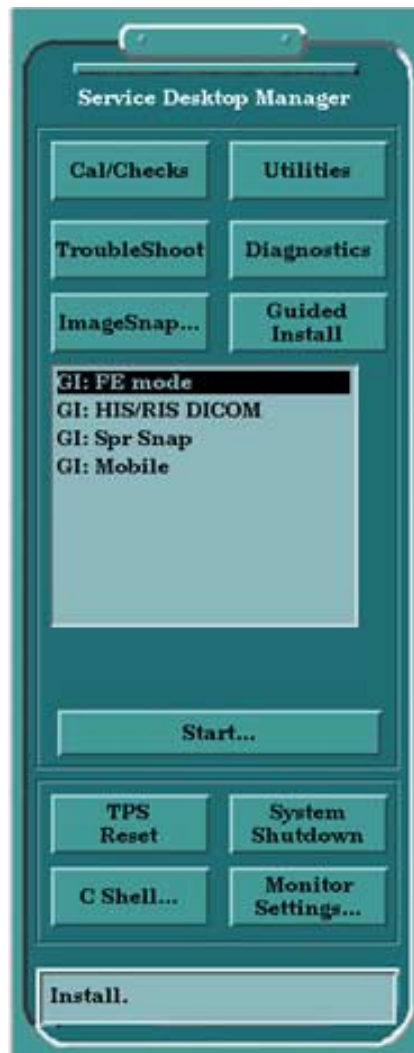
ILLUSTRATION 1-2 GUIDED INSTALL OPTIONS

Next, cursor select the "Mobile" selection in the center text box then push the <Start> button to start the Mobile setup screen. The next screen presented is a command line, which asks for a password. For this screen, the user will need to know the systems root password. Type in the password and push the <Enter> Key to continue to the Mobile setup screen.