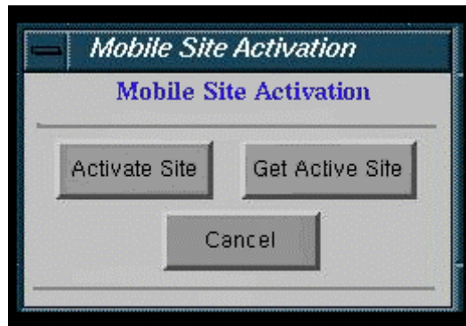
ILLUSTRATION 6-2 SITE ACTIVATION POP-UP WINDOW

Select Activate Site at the Mobile Site Activation pop-up window. See Illustration 6-2