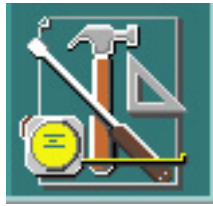
ILLUSTRATION 1-1 SERVICE DESKTOP BUTTON

With Signa up and running in scan mode, enter the service desktop by pushing the service desktop button on the left of screen. See illustration 1-1.