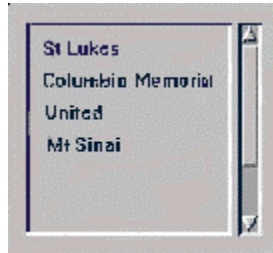
ILLUSTRATION 6-1 SITE LIST

Select Activate at the Mobile Site Setup screen.